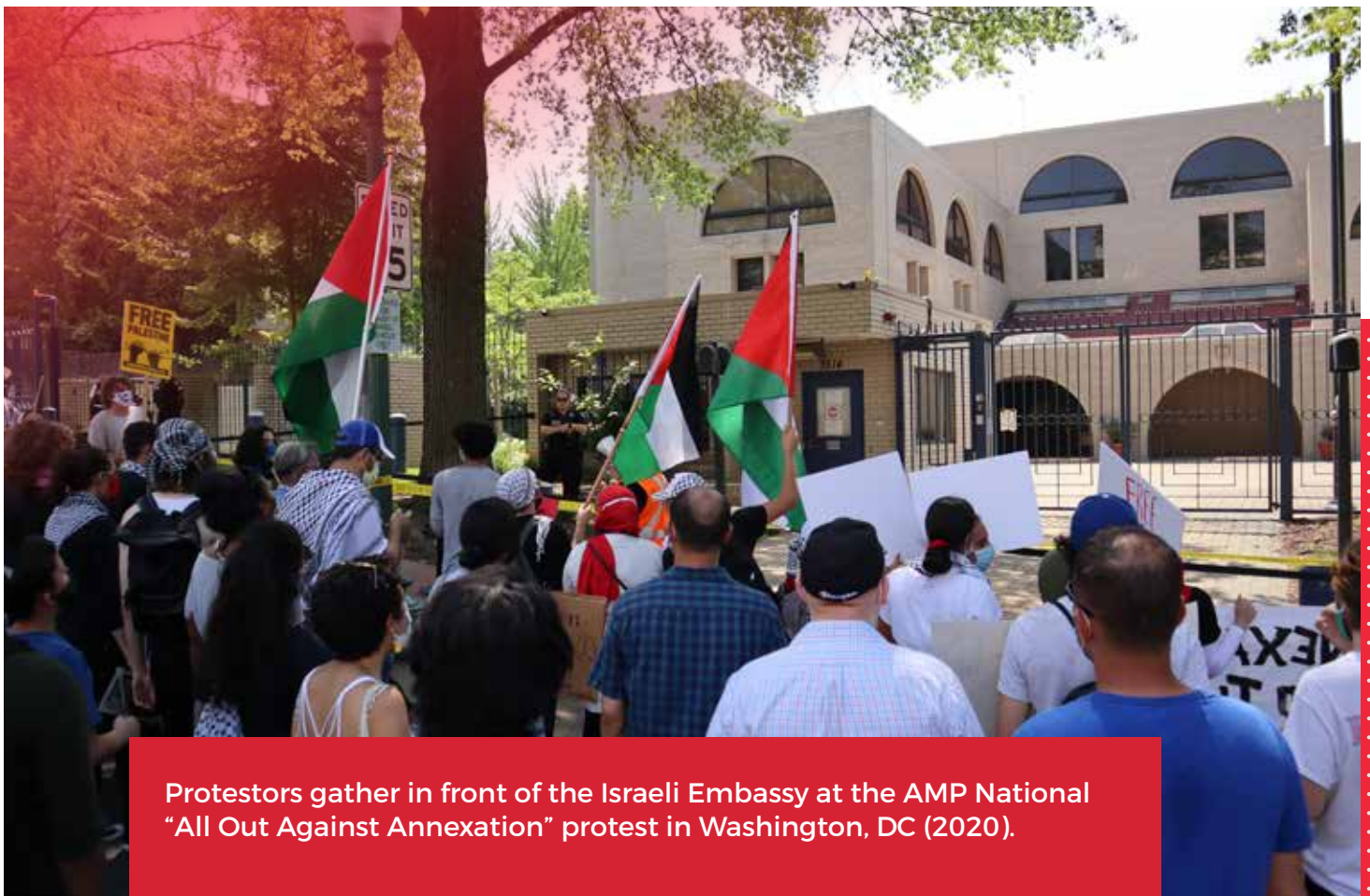
Protestors gather in front of the Israeli Embassy at the AMP National “All Out Against Annexation” protest in Washington, DC (2020).

American Muslims for Palestine is dedicated to advancing the movement for justice in Palestine through education, advocacy, and grassroots mobilization.