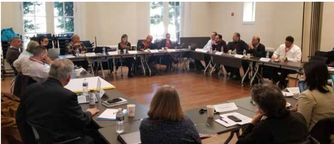
Organizational leaders from around the country gathered at the AMP Policy forum (2020).