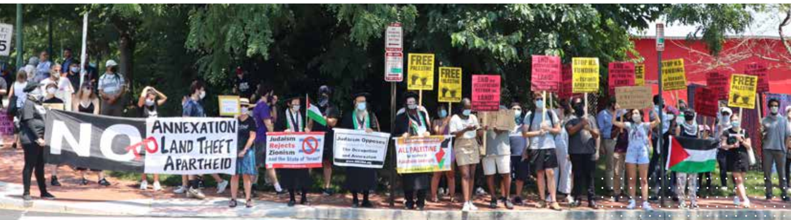
Protestors gather in front of the Israeli Embassy at the AMP National "All Out Against Annexation" protest in Washington, DC