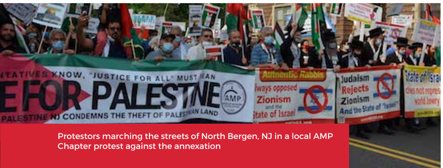
Protestors marching the streets of North Bergen, NJ in a local AMP Chapter protest against the annexation

📍 AMP-Dallas continued to grow this year and tackled important local community issues by working with partner organizations. They participated in local community events such as food festivals, the Palestine festival, and meal distributions to local workers. Our Dallas chapter increased their solidarity work and helped organize protests during the summer to support Black Lives Matter. Dallas also hosted multiple press conferences on important issues like the West Bank's annexation and the 'deal of the century.' And when the normalization agreements were announced, AMP-Dallas hosted a caravan protest to show their community's stance on the issue.