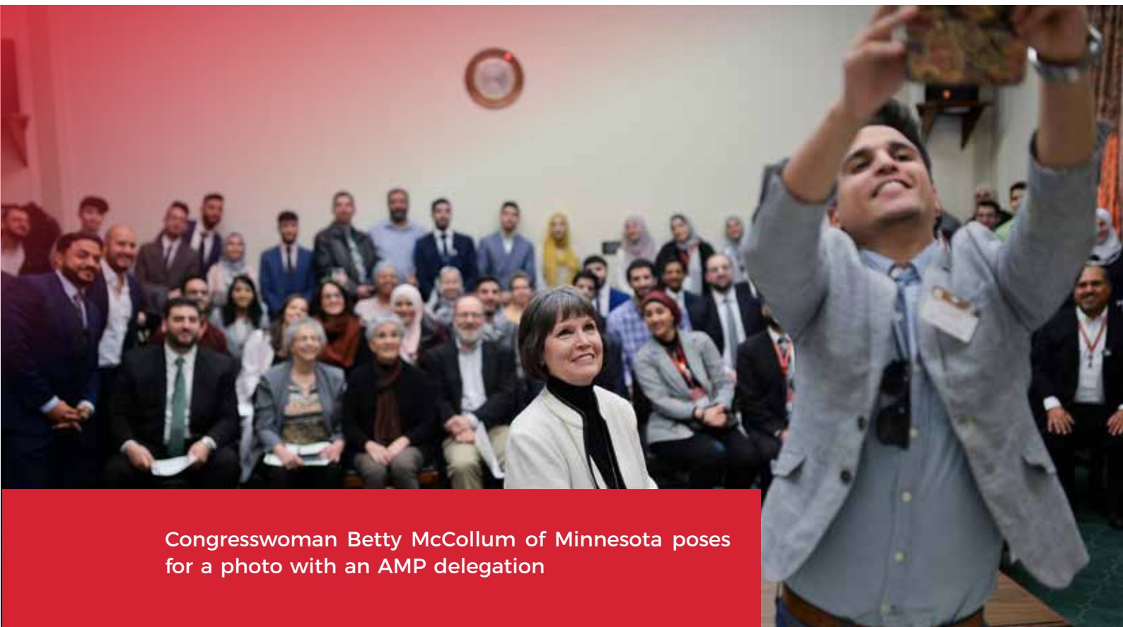
Congresswoman Betty McCollum of Minnesota poses for a photo with an AMP delegation