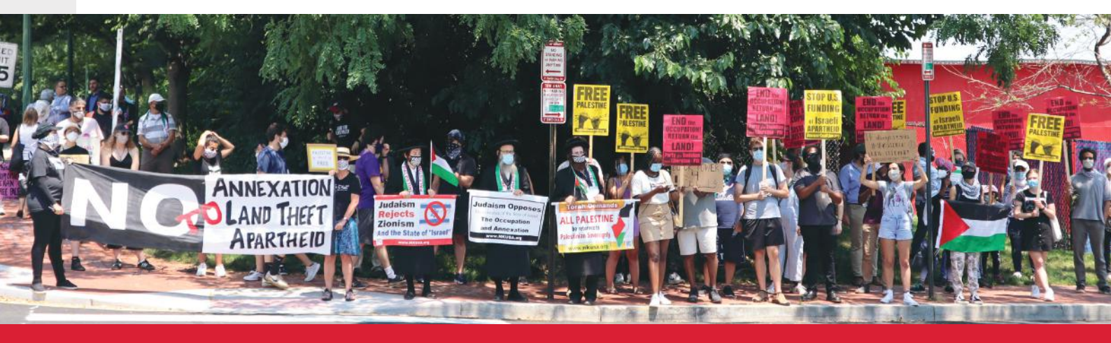
Protestors gather in front of the Israeli Embassy at the AMP National "All Out Against Annexation" protest in Washington, DC (2020).

• Policy paper on the nexus between Zionist normalization and Jewish-Muslim interfaith work. AMP commissioned the writing of a 60-page study which provides an in-depth look into the various mechanism that Zionist organizations utilize to promote Jewish-Muslim interfaith work as a means of tamping down advocacy for Palestinian rights within the Muslim community. This paper will serve as a useful handbook for the Muslim community to engage in forms of interfaith work with Jewish partner organizations to advance justice here and abroad without sacrificing our convictions about Palestine. AMP is currently in the process of finalizing the report for publication in the fall.