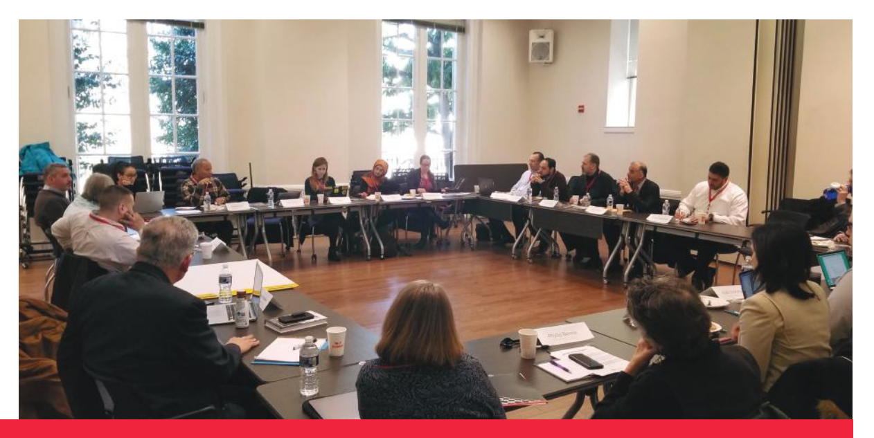
Organizational leaders from around the country gathered at the AMP Policy forum (2020).

AMP's campaign www.platformforpalestine.org with Jewish Voice for Peace Action to include Palestinian rights in the parties' plaftorms, signed by nearly 10,000 people, was a culmination of this effort. AMP also took the lead in assembling and co-convening a 60+ organizational coalition--the Palestine Federal Working Group--to coordinate legislative efforts broadly across the spectrum of groups supporting Palestinian rights, and also launched a Palestine Advocacy Club with its most dedicated supporters to engage in high-level policy training and additional advocacy opportunities.