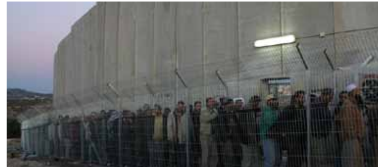
Left: "The hard life of Christians in Bethlehem" eurekaastreet.com.au