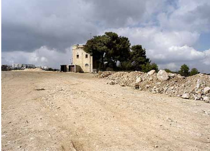
Right: An abandoned house in Bethlehem stands in the middle of lands cleared for the Apartheid Wall's path.