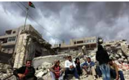
Left: Palestinians sit on the rubble of what was their home after Israeli authorities demolished the building, claiming it was built without proper permits, in the village of Issawiyyeh, in East Jerusalem, on Nov. 18, 2009.